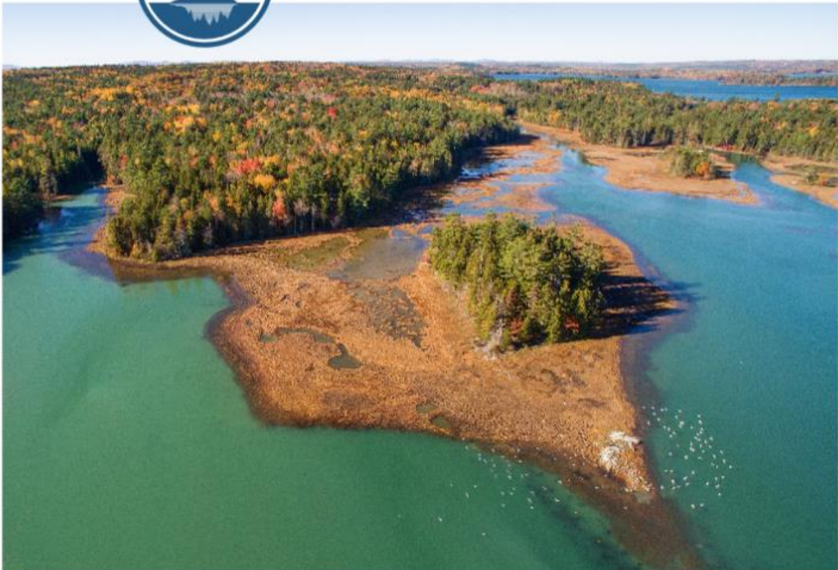
Old Pond, Hancock