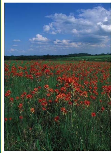
Paint Brush Prairie/MDC

Woodlands are one of Missouri's most threatened natural communities; not because the state is losing tree structure but because of a lack of ground fires. Though Missouri presently adds a million acres of trees every decade, today's woodlands differ in species composition and structure from those shaped by fire, and thus support different wildlife species. The Thousand Hills Woodland Conservation Opportunity Area is one location where we hope to increase prescribed fire management on public and private lands.