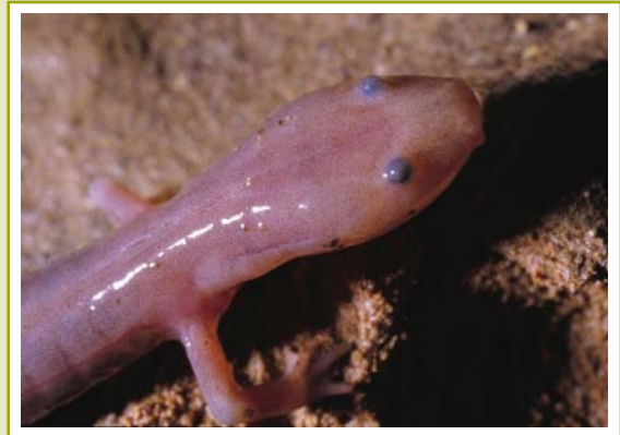
Grotto salamander