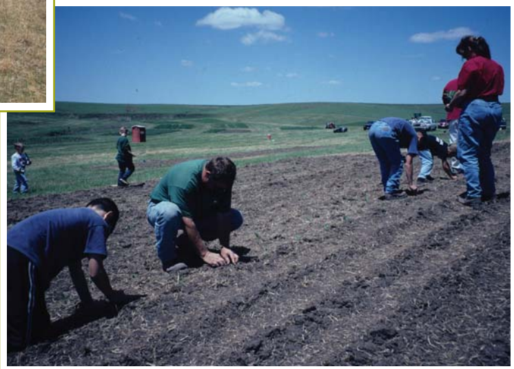
Pawnee Nursery Planting/MDC